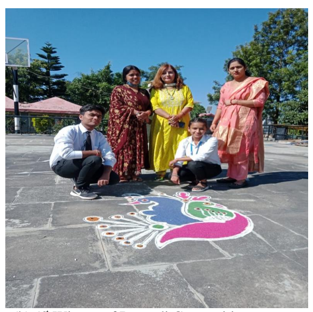
(b) 1<sup>st</sup> Winner of Rangoli Competition