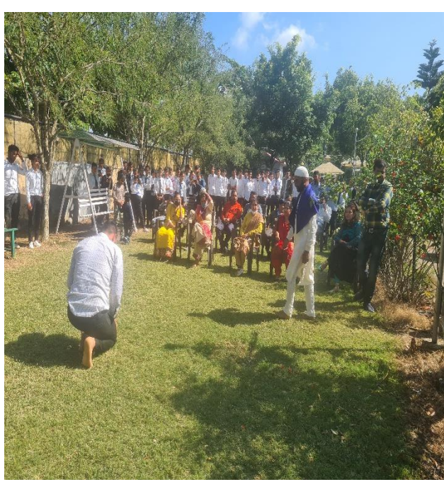
Play activity by students